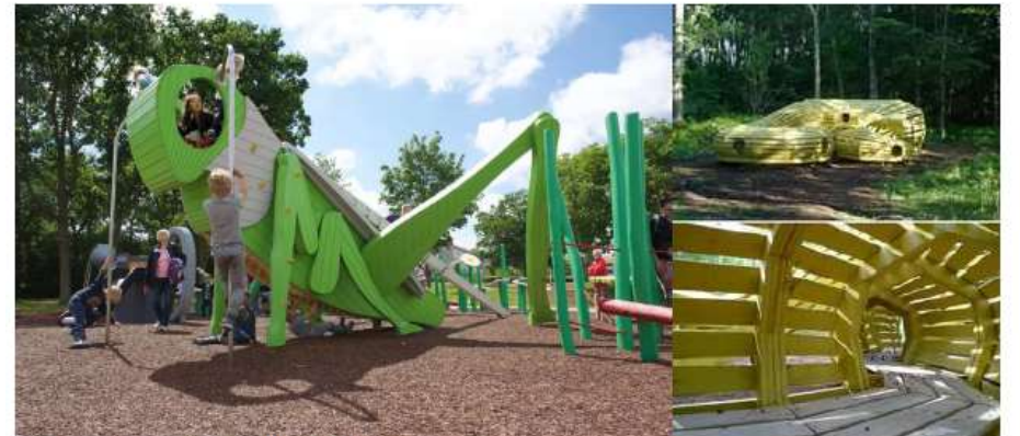
Imatges de referència elements singulars