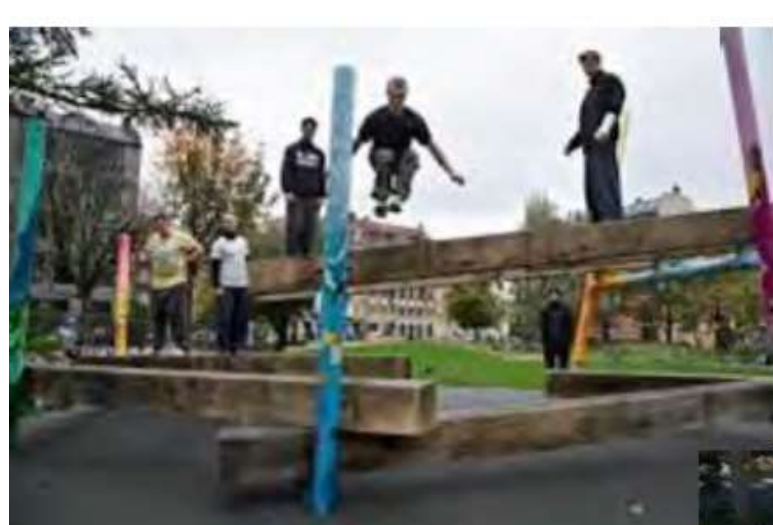
Special focus on adolescence