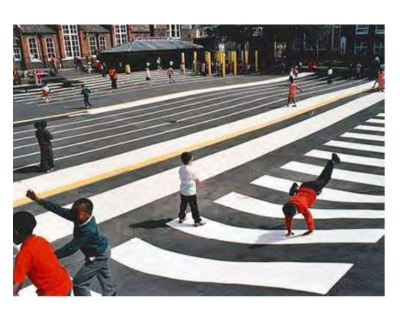
Different colours and textures